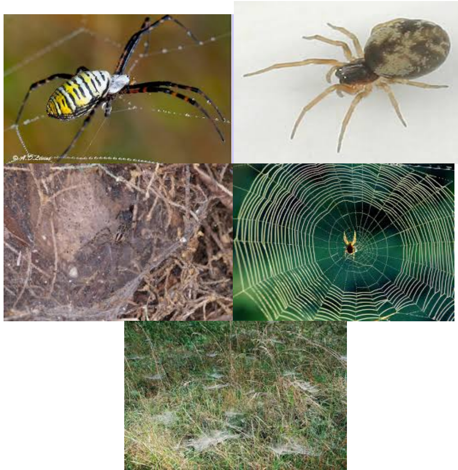
Fig. (2): Spider species and their webs